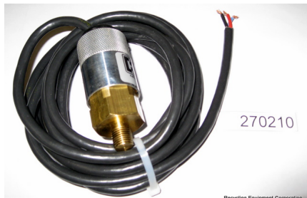
Recycling Equipment Corporation NASON_1000_3000__49f07dbb3ab01.jpg